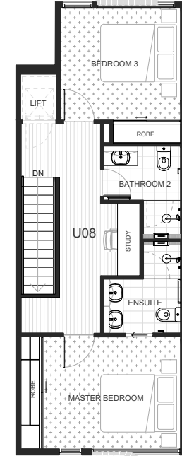
SECOND FLOOR - OPTION